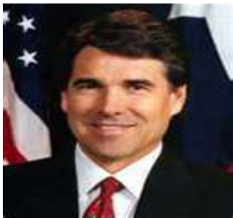
Texas Governor Rick Perry Welcoming and greetings letter.